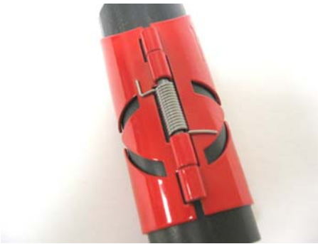
Spring Closure Design for Sure Grip to the Pipe!