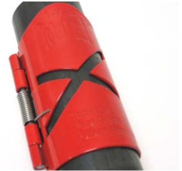
Powder Coated Finish for Long Lasting Service!